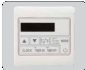
Complete with a digital keyboard allowing all operation parameters to be set and displayed on the control panel.